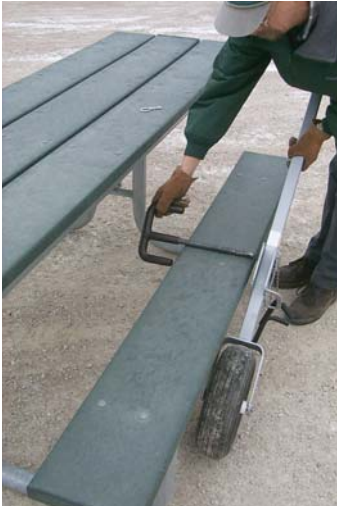
Slide the Seat Hook under the seat plank and into the Table Mover Post and secure it.