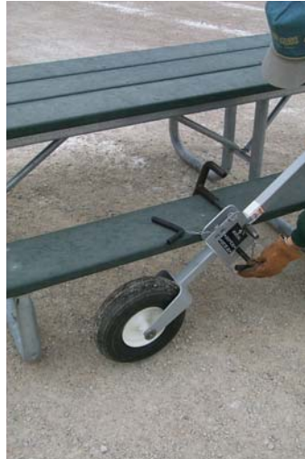
Slip the first Lifting Pin under the plank and swing its handle into the locking loop.