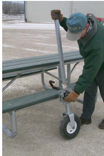
Install the second Lifting Pin and secure it. Repeat the installation on the opposite seat plank.