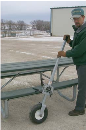
Raise the Table Mover post to a vertical position.