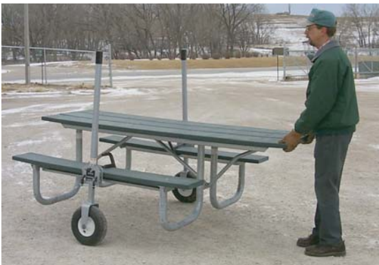
Lift one end of the table and roll it away. The Table Mover fits most brands and styles of tables.