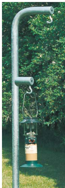
(Above) Model LH/G-1/A Lantern Holder with galvanized finish and Optional Wheelchair Accessible hook. (Left) Model LH/G-1 Lantern Holder with galvanized finish.