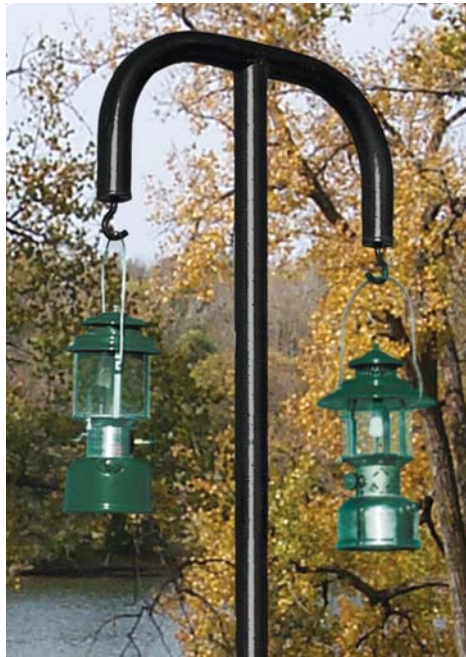
(Above) Model LH/B-2 Lantern Holder with Black enamel finish, will hold two lantern. (Left) Model LH/G-180 Lantern Holder with galvanized finish, will hold one lantern.