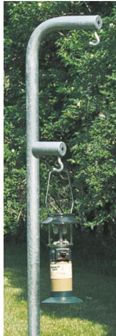
(Above) Model LH/G-1A Lantern Holder with galvanized finish and welded-on Wheelchair Accessible Hook. (Left) Model LH/G-1 Lantern Holder with galvanized finish.