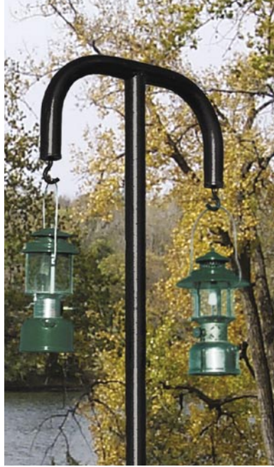
(Above) Model LH/B-2 Lantern Holder with Black enamel finish, will hold two lantern. (Left) Model LH/G-180 Lantern Holder with galvanized finish, will hold one lantern.